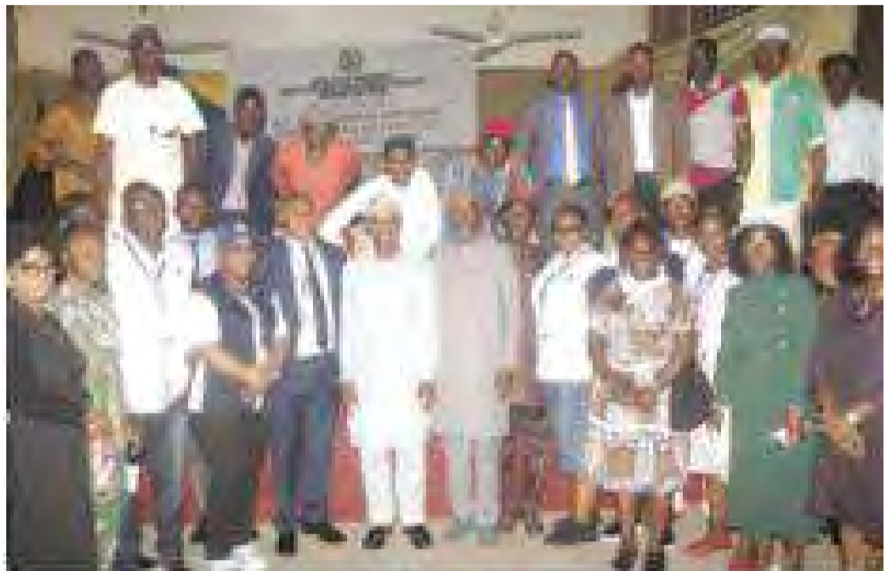
present Sanwo-Olu for its administration in the State led by Mr. Babajide Olusola commitment to ensuring quality education in Lagos State.